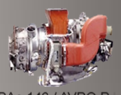
BAe 146 / AVRO RJ APS1000-C3