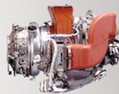
Fokker 50 APS1000-C2