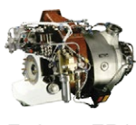
Embraer ERJ APS500-C11 APS500-C14