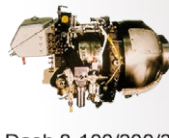
Dash 8-100/200/300 APS500-C7B APS500-C7D