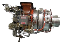
Bombardier Dash 8-400 APS1000-C12